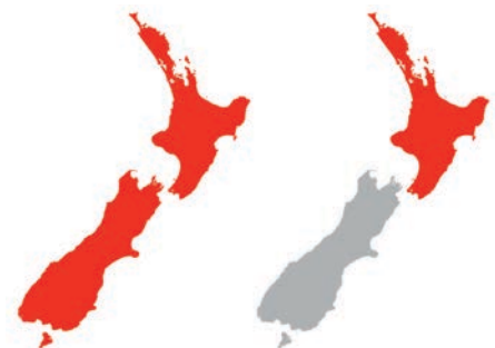
All of New Zealand

WE HAVE SEVERAL AREAS THAT YOU CAN SELECT FOR YOUR ONSERT