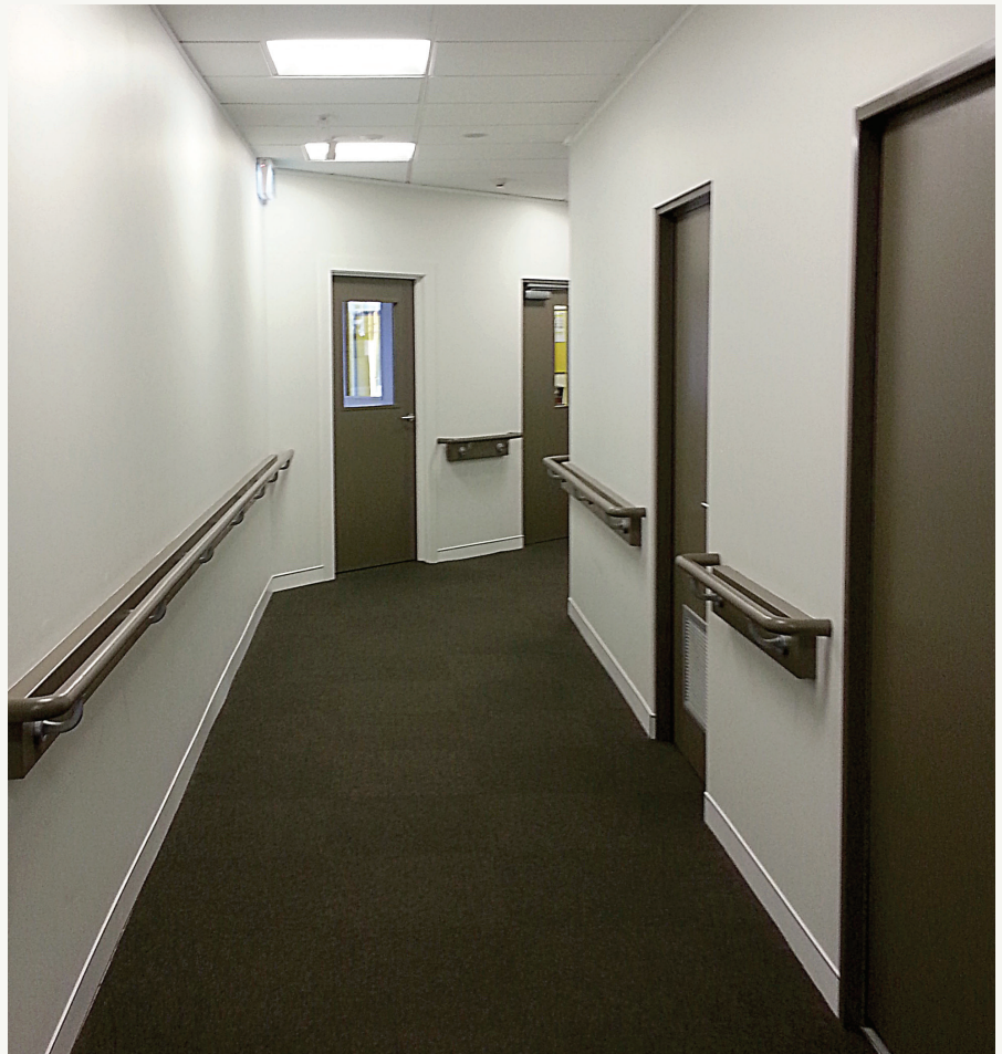
Figure 2 Dark doors, floor coverings and handrails provide good contrast with white walls.

When there are too many other sounds, such as music or excessive reverberation from hard surfaces, the sounds that aid navigation may not be audible. Acoustic design and managing sound therefore needs to be a significant consideration in the design of public buildings. For example: