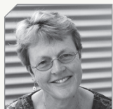
BY ALIDE ELKINK, FREELANCE TECHNICAL WRITER, WELLINGTON